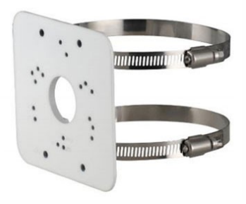
CP-UA-B2P Pole Mount